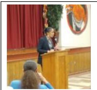
Prince George's County State's Attorney Angela Alsobrooks addressed the community in September.